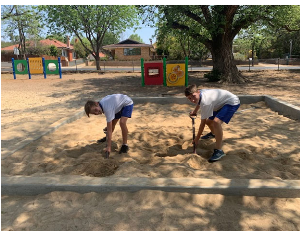
The excitement of new sand. A big thank you to Stage 3 students who helped spread it around