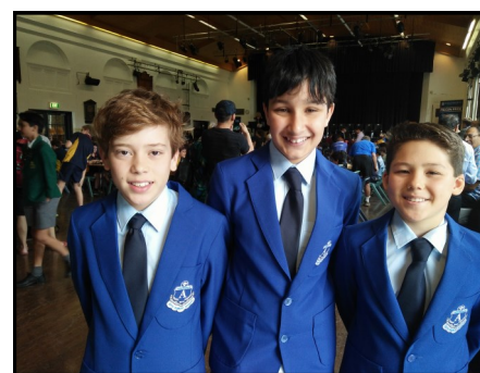
State Chess Team