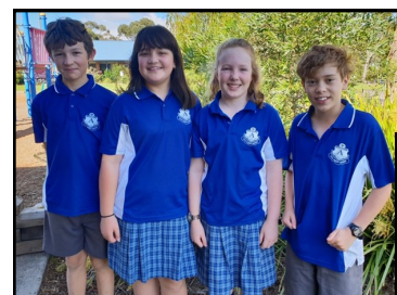
State Debating Team