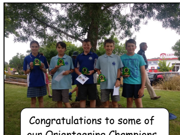
Congratulations to some of our Orienteering Champions